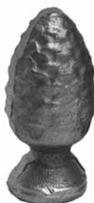
Art. 749/4 Ø 27 mm H 65 mm