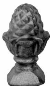
Art. 749/17 Φ 25 x 25 mm H 60 mm