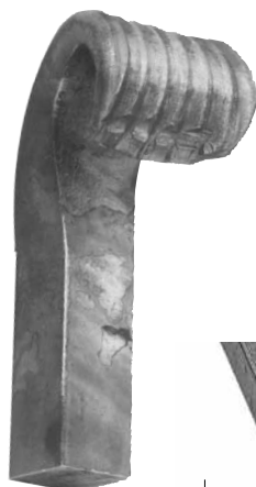
H 300 mm