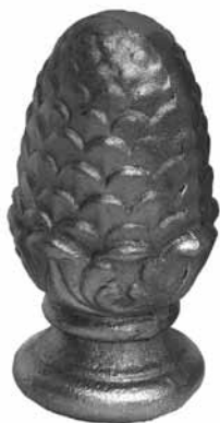
Art. 749/7 Ø 28 mm H 55 mm