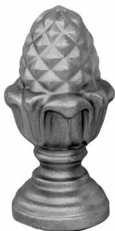
Art. 749/12 Ø 30 mm H 60 mm