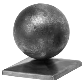
Sfera vuota - Hollow sphere

● Forgiati a caldo Hot stamped solid steel