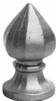
Art. 128/31 Ø 100 mm H 180 mm